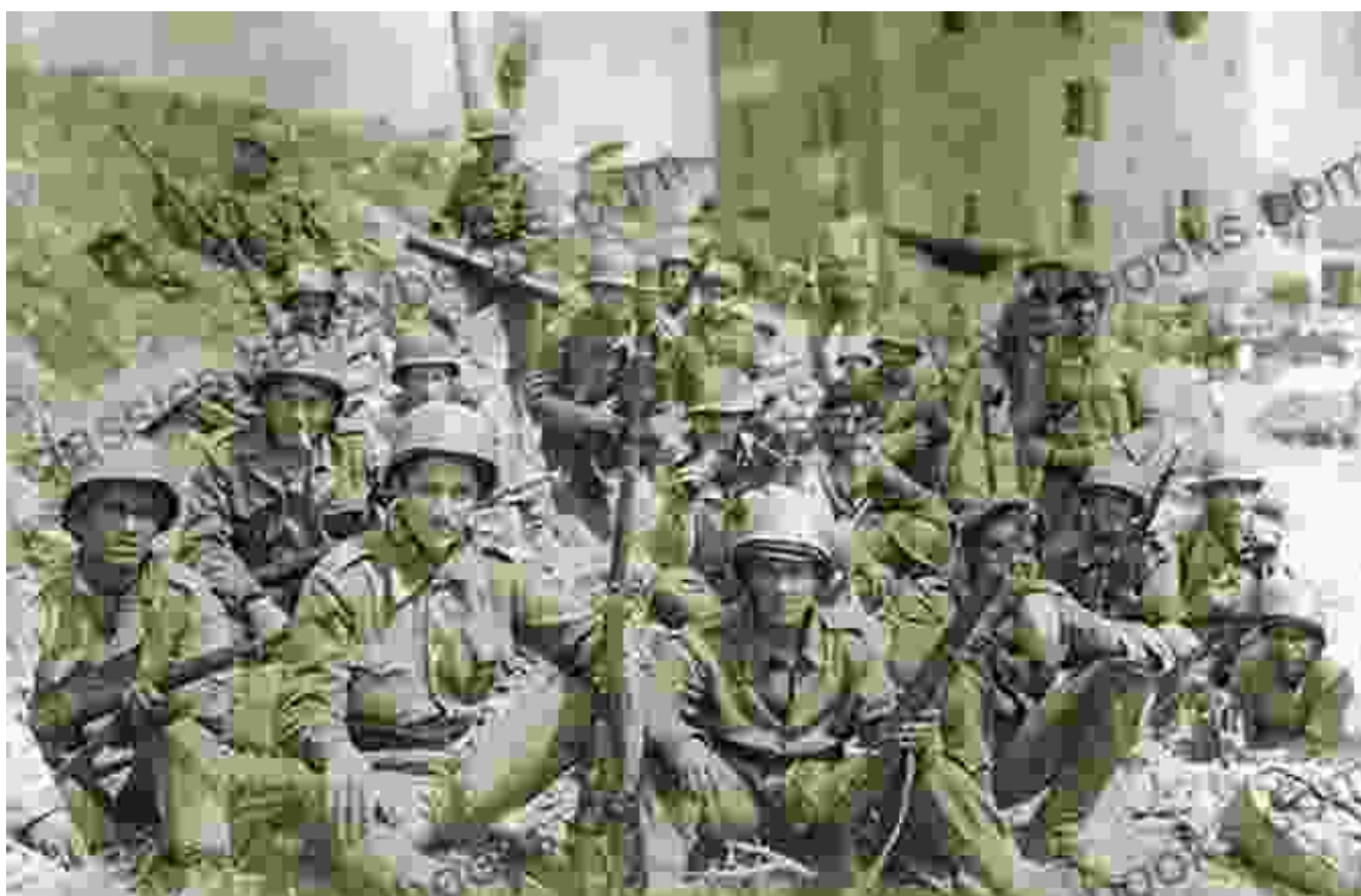
Brazilian soldiers fighting in the Battle of Monte Castello.

The BEF continued to fight in Italy for the remainder of the war, participating in a number of key battles, including the Battle of Anzio and the final offensive in the Po Valley. The Brazilians distinguished themselves for their courage and determination, and their contributions to the Allied victory were widely recognized.